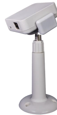
Anchor mounting with holder

Anchor is a referential node with a known position. Set of anchors creates location infrastructure for mobile nodes which are located.