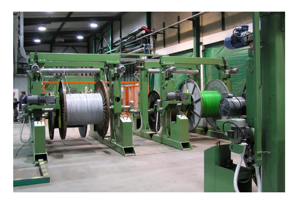
Heavy industrial environment in Prakab.